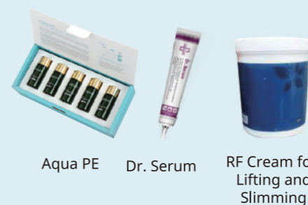
Aqua PE Dr. Serum RF Cream for Lifting and Slimming

AQUA PE [For all skin Type -For the general skin, 30ml]